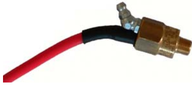
WDB1 series bronze body Cable entry