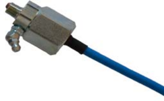
WDB2 series steel body Conduit entry